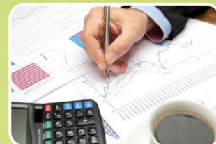
DPR and FUPs