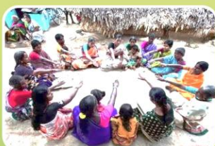
Support to FPOs/ SHGs/ Cooperatives