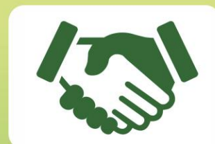
Branding & Marketing