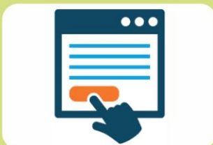
Application for the Subsidy